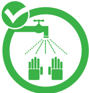
Wash Hands Thoroughly