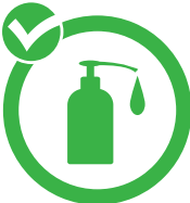
Use Soap or Hand Sanitizer