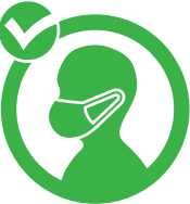
Use Face Mask or Respirator