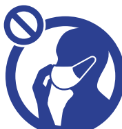
Do Not Touch The Front Part of a Mask