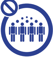
Avoid Large Crowds