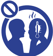
Do Not Meet Infected or Sick People