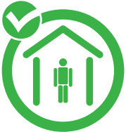
Stay at Home if Possible