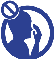
Do Not Touch Your Face esp. Mouth, Eyes, Nose